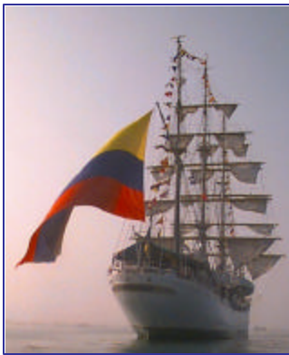
S/V Gloria, Monterey Harbor